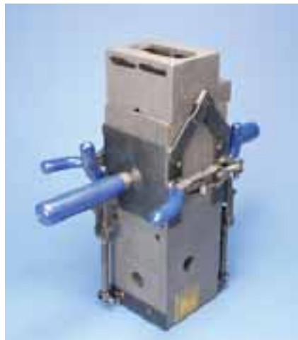
"M" and "V" Price Key Mold Includes Frame with Handles