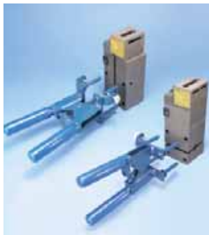
"C", "D", "F", "R", "Q" and "Z" Price Key Mold L160 or L159 Handle Clamp Required